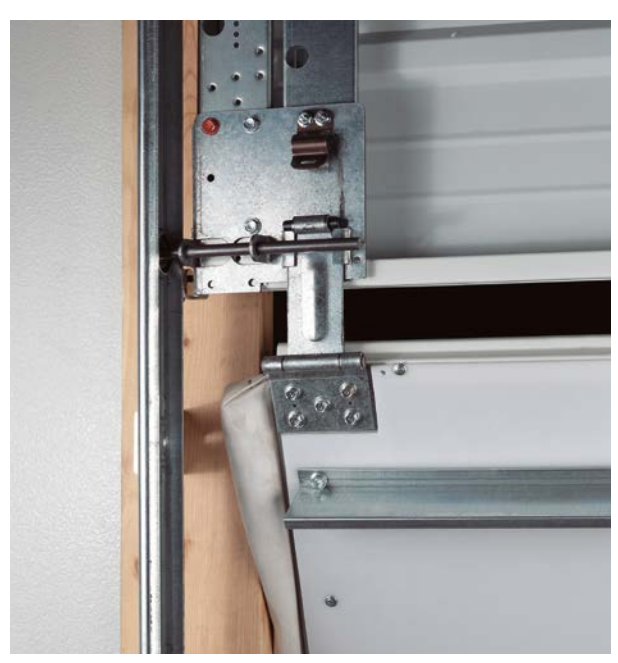
Inside View of Single Bottom Section

Clopay's break-away bottom sections will release from the track and swing up to a full 45° angle inward or outward, preventing further damage to the door. The cable attachment at the bottom of the second or third section enables the door to continue operating after being struck. The bottom sections can be snapped back into place in less than a minute. The bottom sections have a fiberglass or polycarbonate sheet on the inside of the sections to resist dents and maintain an attractive appearance. These sections are available on the 1-3/4" (44.5 mm) and 2" (50.8 mm) thick 3000 Series polystyrene and polyurethane insulated doors.