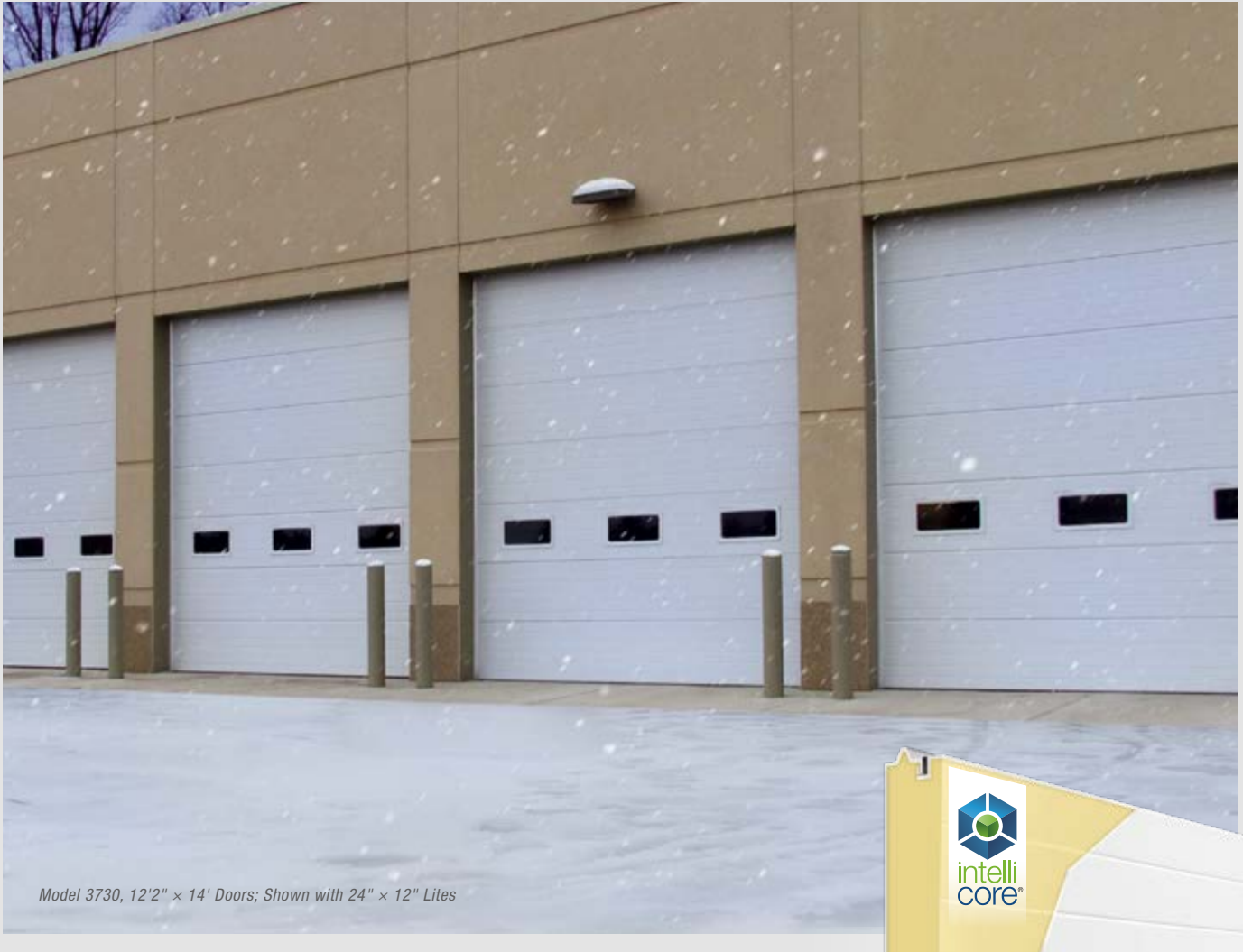
Model 3730, 12'2" x 14' Doors; Shown with 24" x 12" Lites